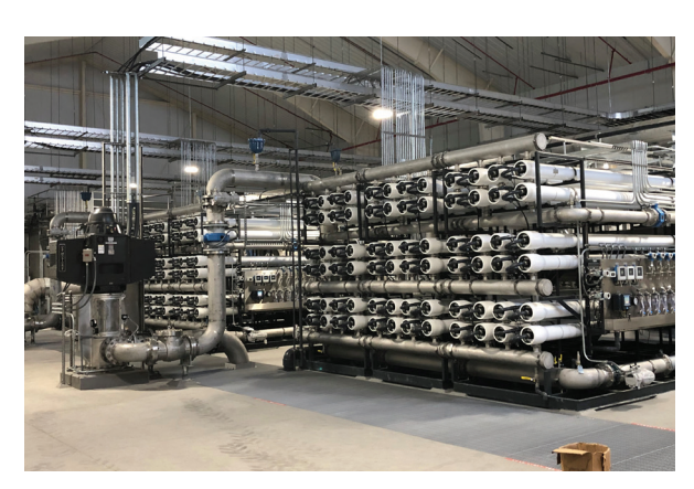
Reverse osmosis filtration units (called "skids") inside the expanded ECCV Northern Water Treatment Plant.

While renewable water is the most dependable source of water in the long-term, it can be impacted by drought. That's why ECCV also operates deep aquifer wells both in our service area and in the Highlands Ranch area. Deep aquifers don't refill quickly, so once water is removed, it's essentially gone for good. However, by using these wells to supplement its renewable supply in dry periods, ECCV can better meet customer demand without putting too much strain on the aquifer. The result is a drought resistant water system that is positioned to deliver reliable water service now and well into the future.